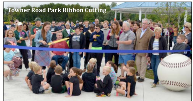
Towner Road Park Ribbon Cutting

Located at 2055 Towner Road in Haslett, Towner Road Park includes two multi-use athletic fields for lacrosse, football and soccer; two multi-use ball fields for baseball, softball and kickball with dugouts; six pickle ball courts, a large pavilion, restroom building, 1/3 mile paved loop walking trail and paved parking lot.