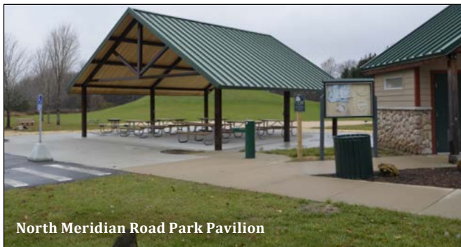
North Meridian Road Park Pavilion

Expansion of the parking lot is planned for 2019.